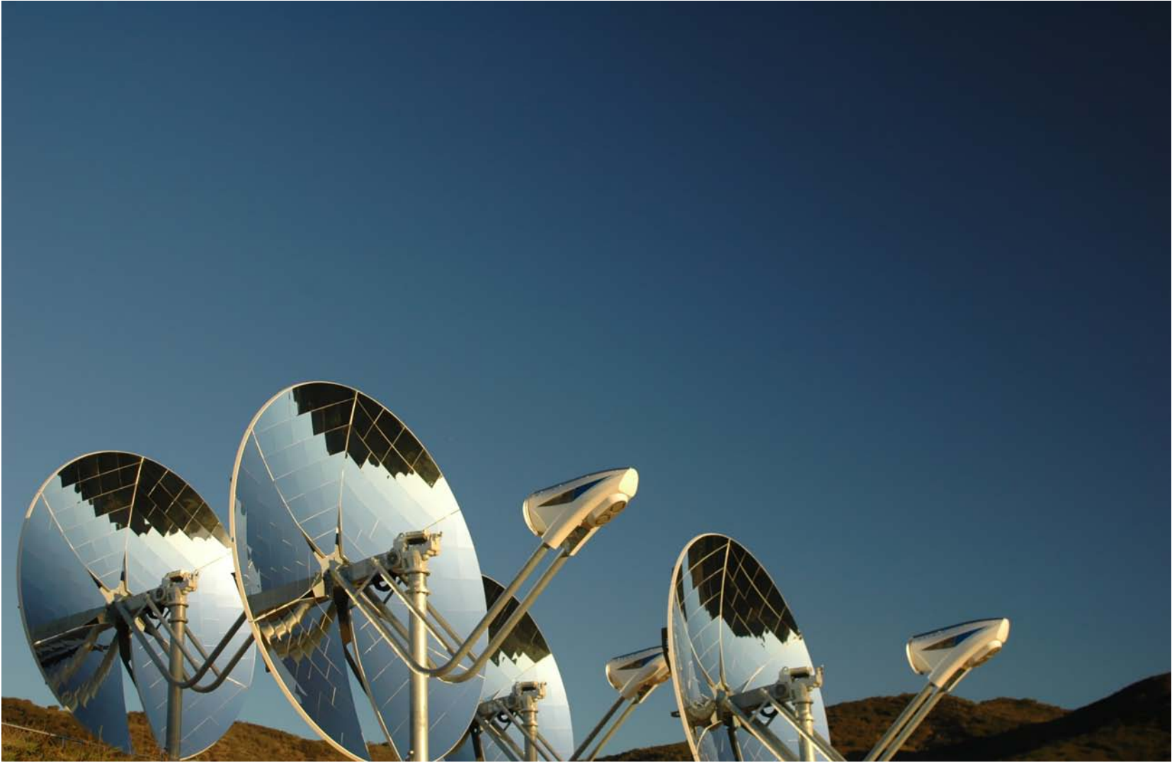
FOCUS YOUR ENERGY