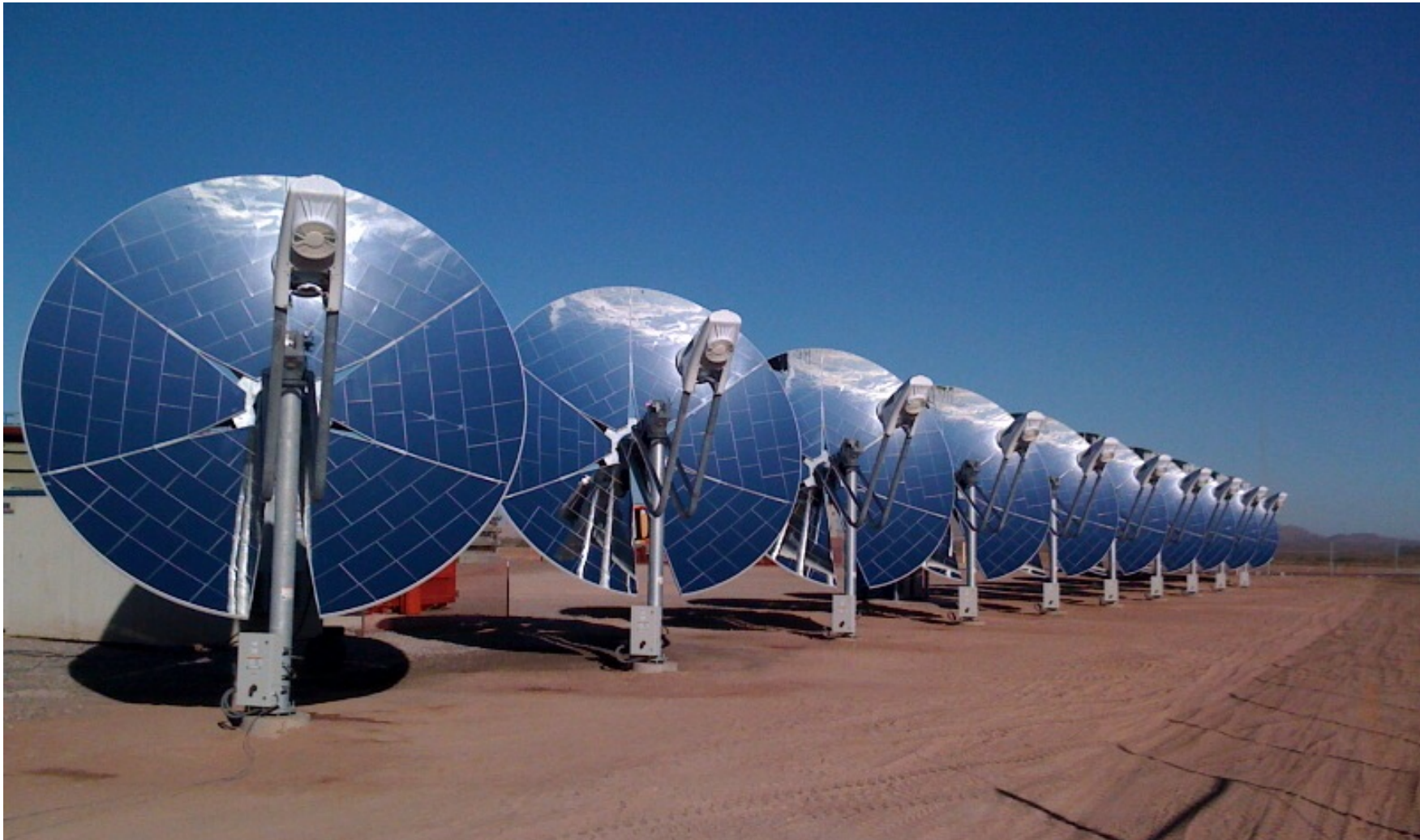
FOCUS YOUR ENERGY

☐O? ? ? ☐?☐ ☐☐ ☐☐n☐m☐?n☐ ? ? ☐☐s☐☐ ☐O?☐☐